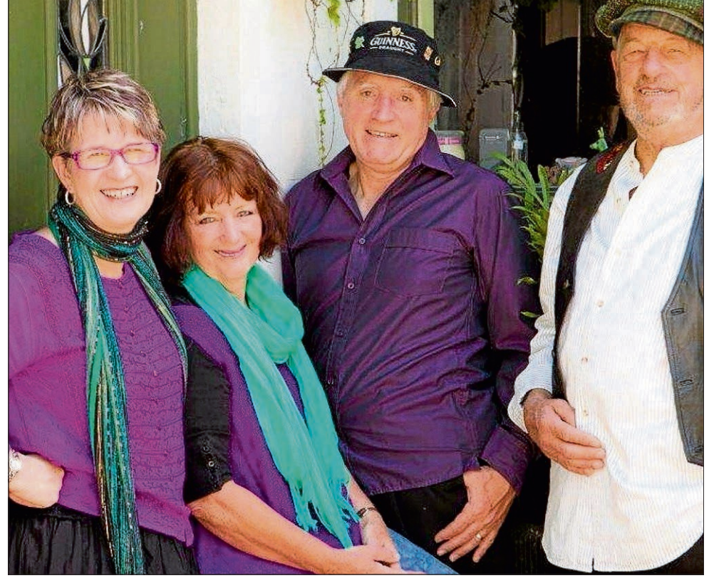
ST PAT'S: Local band Shamrock will proudly perform Irish music on St Patrick's Day,

"We believe the development of Bordertown Intermodal will open a new gate to more opportunities and we are proud of being part of the whole picture."